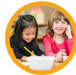
Connecting with America for Early Ed