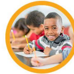
Your Advocacy Matters