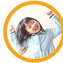
Take Action With America for Early Ed!