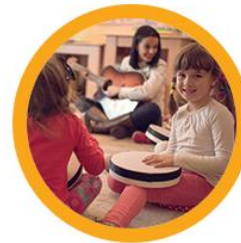
Actions & Resources for Early Childhood Education Advocacy