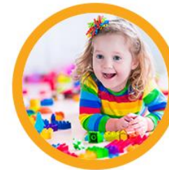
News Around Early Childhood Education