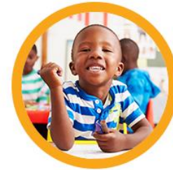
Make Time for America for Early Ed!